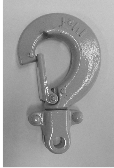
Figure 2 Single Fall Top – 1 ½ & 3 Ton