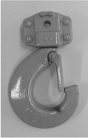
Figure 1 Single Fall Bottom – 1 ½ & 3 Ton