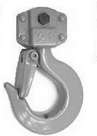
Top / Bottom Hook with STRONG LATCH

2. Heavy Duty Hook Latch – The hook latch on the M3CB Mining Hoist is a different design from the hook latch on the standard M3CB. It is rugged to withstand severe working conditions. This results in a reduced “g” dimension of the hook – the table below gives the “g” dimensions for the hook on the M3CB Mining Hoist.