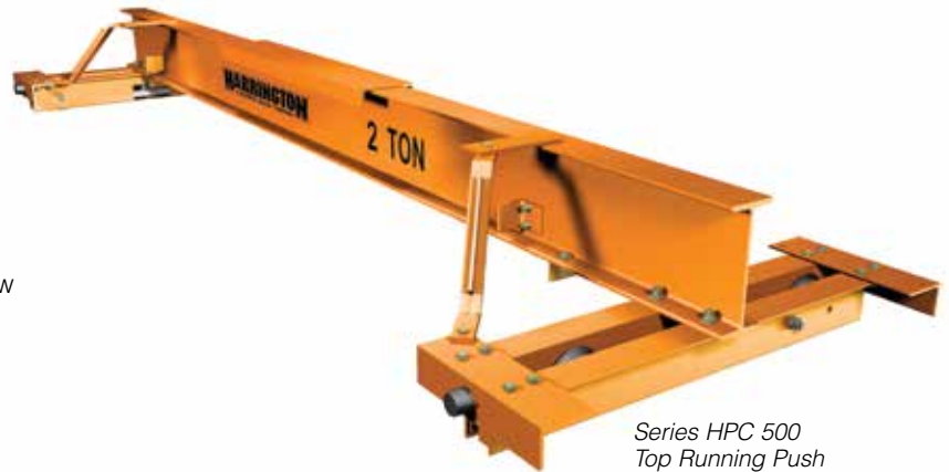
Series HPC 500 Top Running Push Complete Crane