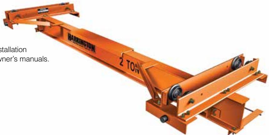
Series HPC 500 Underhung Push Complete Crane